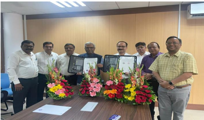
MoU between CIP & RIMS 2023