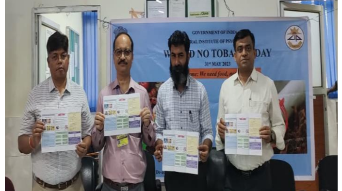
World No Tobacco Day 2023