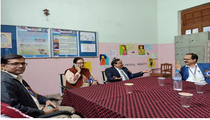
Annual Sports 2023