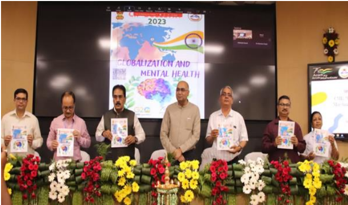
Foundation Day 2023