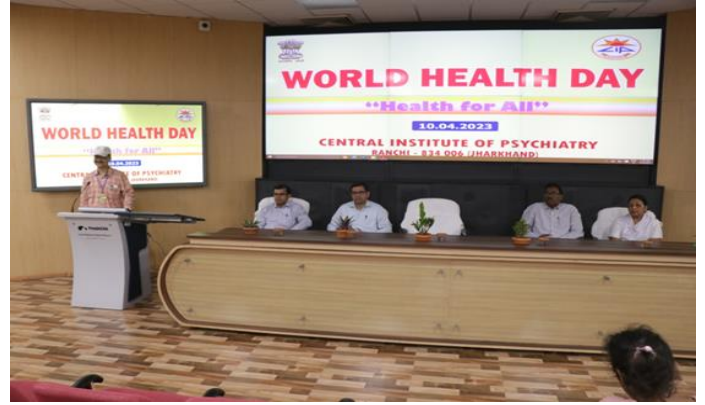
World Health Day 2023